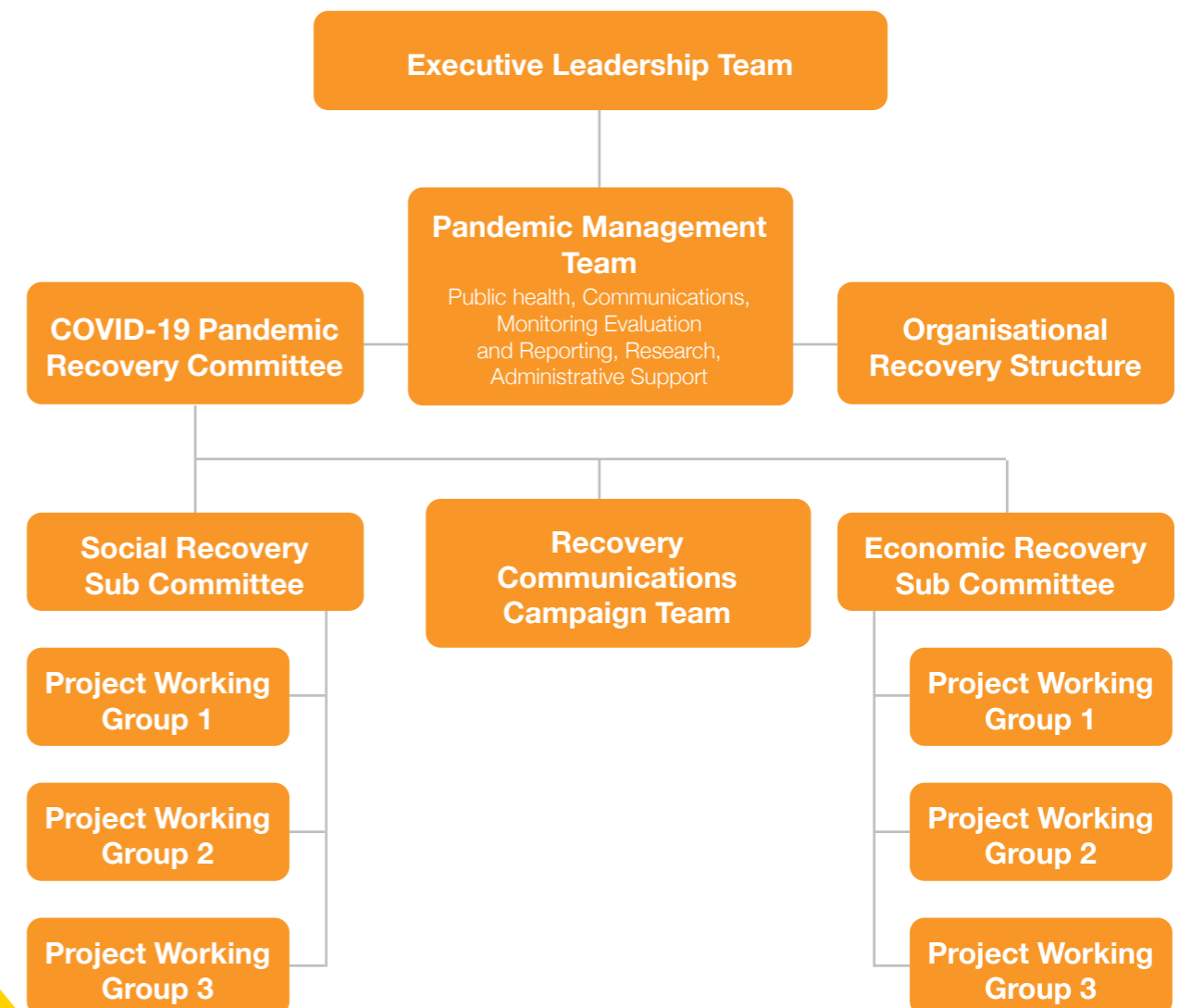
Figure 2 – Pandemic Recovery Governance Structure

The governance structure below, recognises Council's organisational recovery focus and provides the opportunity to connect and identify Council service delivery priorities that can effectively support community recovery outcomes. This connection will allow for Council service areas to prioritise recovery activities across the medium to long term recovery stages.