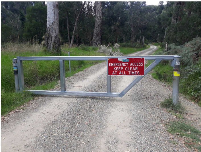
(images are illustrative only and do not override other information provided)