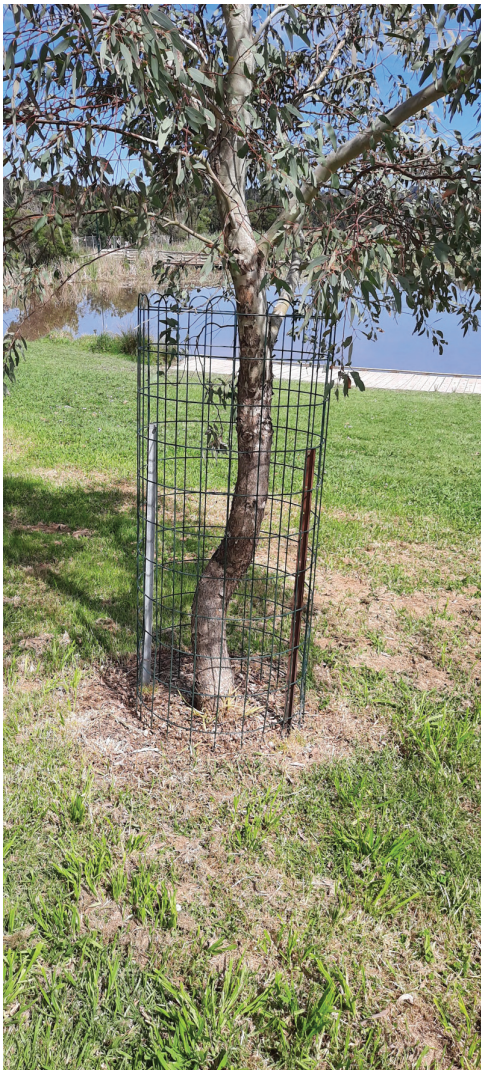
(images are illustrative only and do not override other information provided)