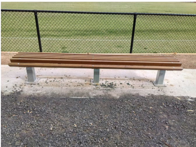
(images are illustrative only and do not override other information provided)