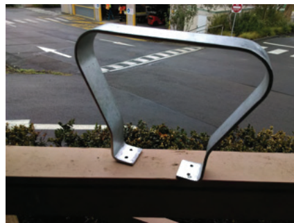
(images are illustrative only and do not override other information provided)