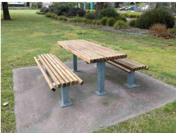
(images are illustrative only and do not override other information provided)