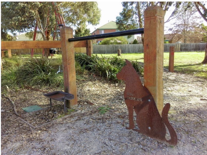
(images are illustrative only and do not override other information provided)