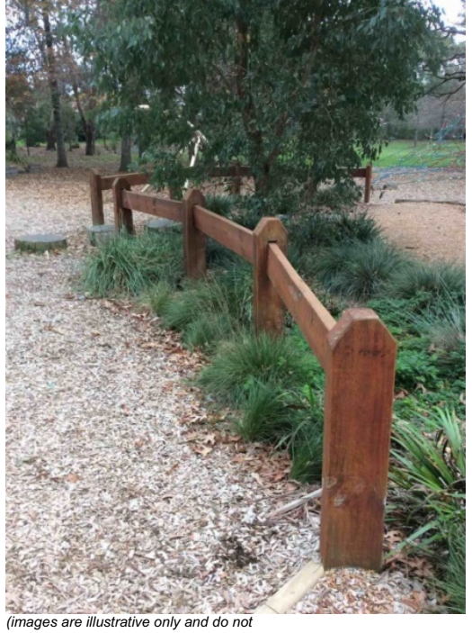
override other information provided)