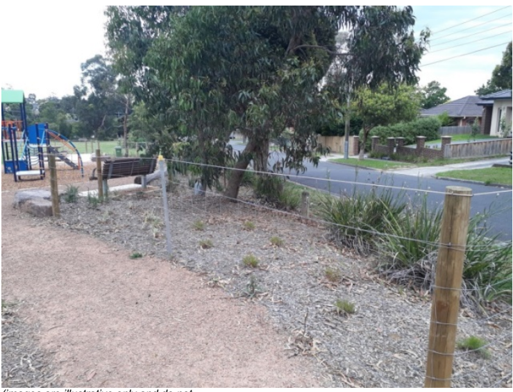
(images are illustrative only and do not override other information provided)