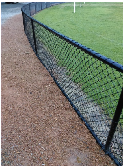
(images are illustrative only and do not override other information provided)