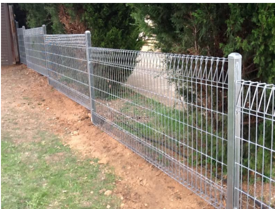
(images are illustrative only and do not override other information provided)