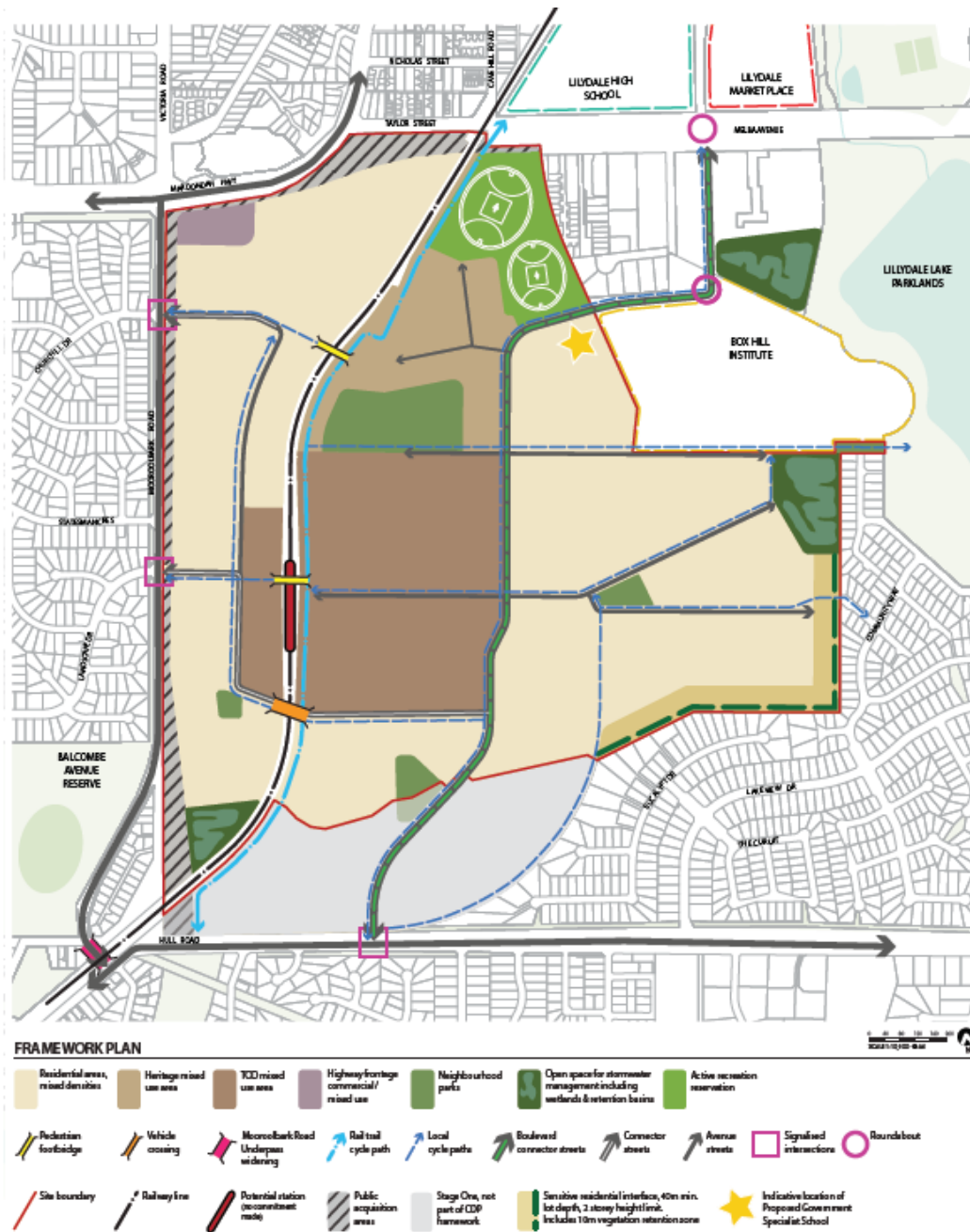
Figure 2 –CDZ 1 Framework Plan (Urbis, 2020)