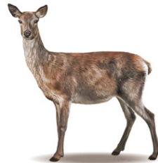
Red Deer Hind

Red Deer are medium size (90-160kg), living in single sex groups