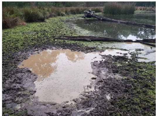
Wallow damage caused by deer