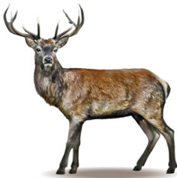
Red Deer Stag

Sambar are large (110-270kg) and live in family groups