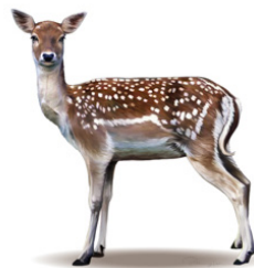
Fallow Deer Hind

Fallow are smaller (35-90Kg) usually found in herds