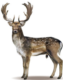
Fallow Deer Buck

Red Deer are medium size (90-160kg), living in single sex groups